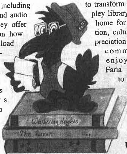
Ripley The Raven is the new Jackson County Public Library Mascot

people of Jackson County enjoy. The library reaches all interest groups by providing a variety of resources such as traditional paper books and newer medias including eBooks and audio tapes. They offer courses on how to download these eBooks and the friendly staff is always willing to answer any questions that patrons may have.